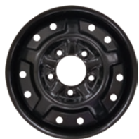
MSPN 49265 & 10545

Note: All UTV/ATVs use 60° / Conical / Tapered Lug Nuts.