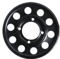
MSPN 21709 & 29242