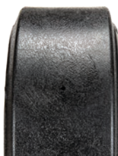
15" Smooth Polyresin Tread