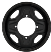
MSPN 75085 & 82599