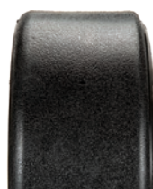
13" Smooth Polyresin Tread