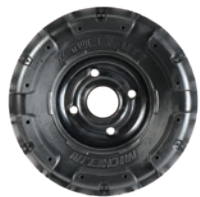
MSPN 68495, 67693, 65492, 64998 & 03488

Note: All UTV/ATVs use 60° / Conical / Tapered Lug Nuts.